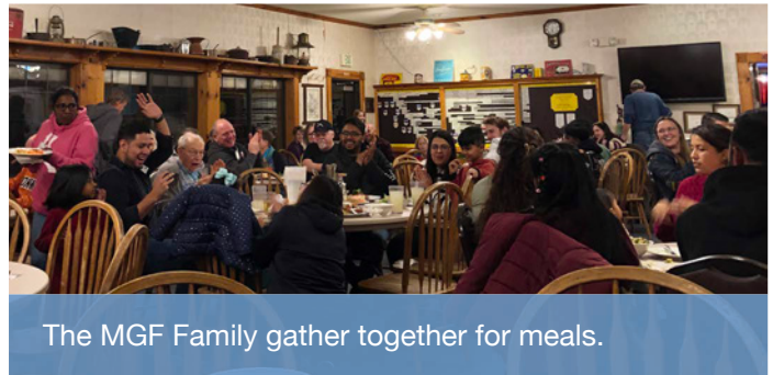
The MGF Family gather together for meals.