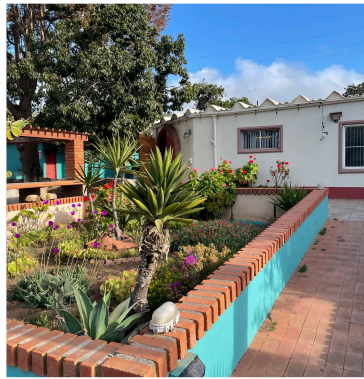
La Jolla Salon