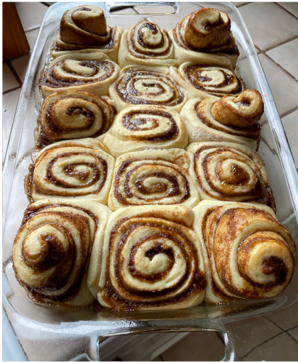
Cinnamon Rolls for the Men's Breakfast